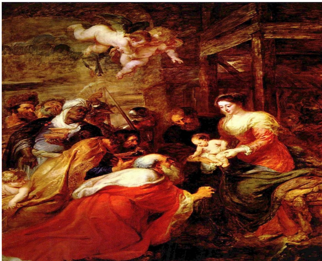
Adoration of the Magi Peter Paul Rubens (1577-1646)

Music by Dietrich Buxtehude and Henry Purcell