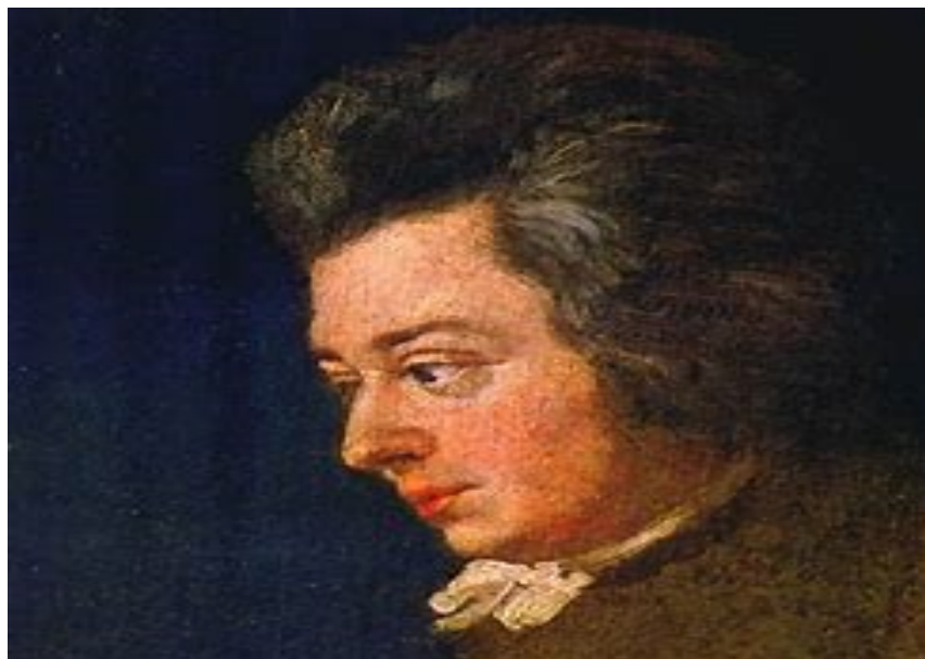
Detail of the unfinished portrait of Mozart by his brother-in-law Joseph Lange in 1782-1783

Wednesday 9 th April 2025 at 7.45pm Saint Peter's Cathedral, Belfast BT12 4BU