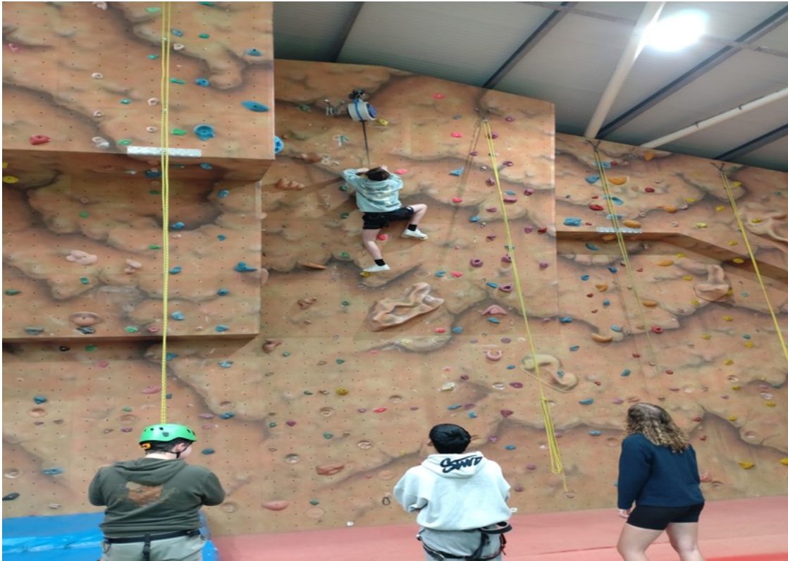
The BB having fun at the Ganaway Activity Centre