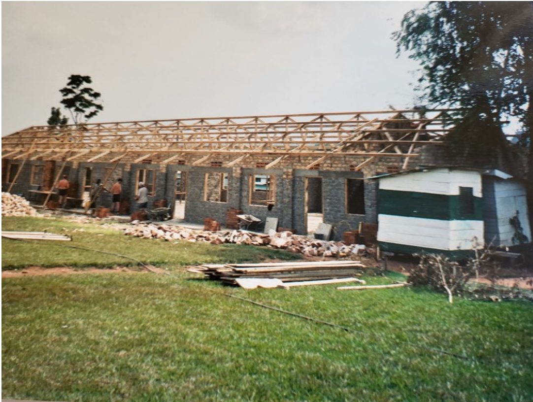
Building work in progress